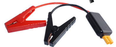
SMART BOOSTER CABLES